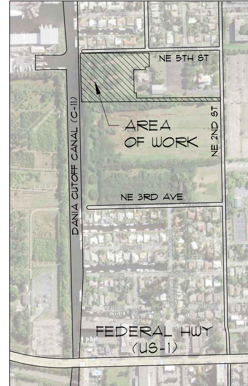
KEY PLAN DANIA BEACH MEGAPORT N.T.S.